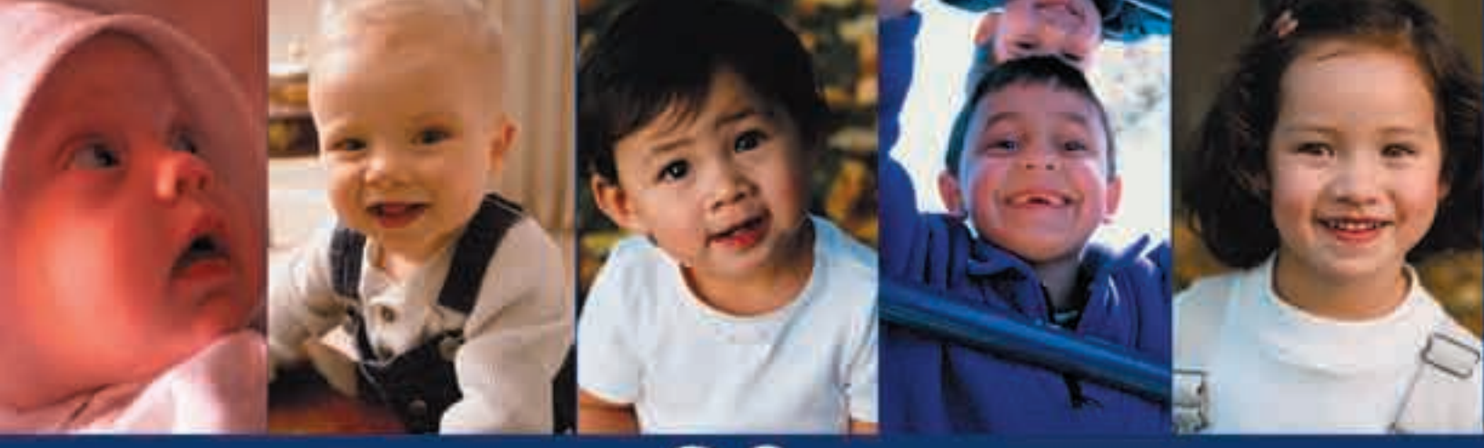
Children's Advocacy Institute 20th Anniversary Retrospective