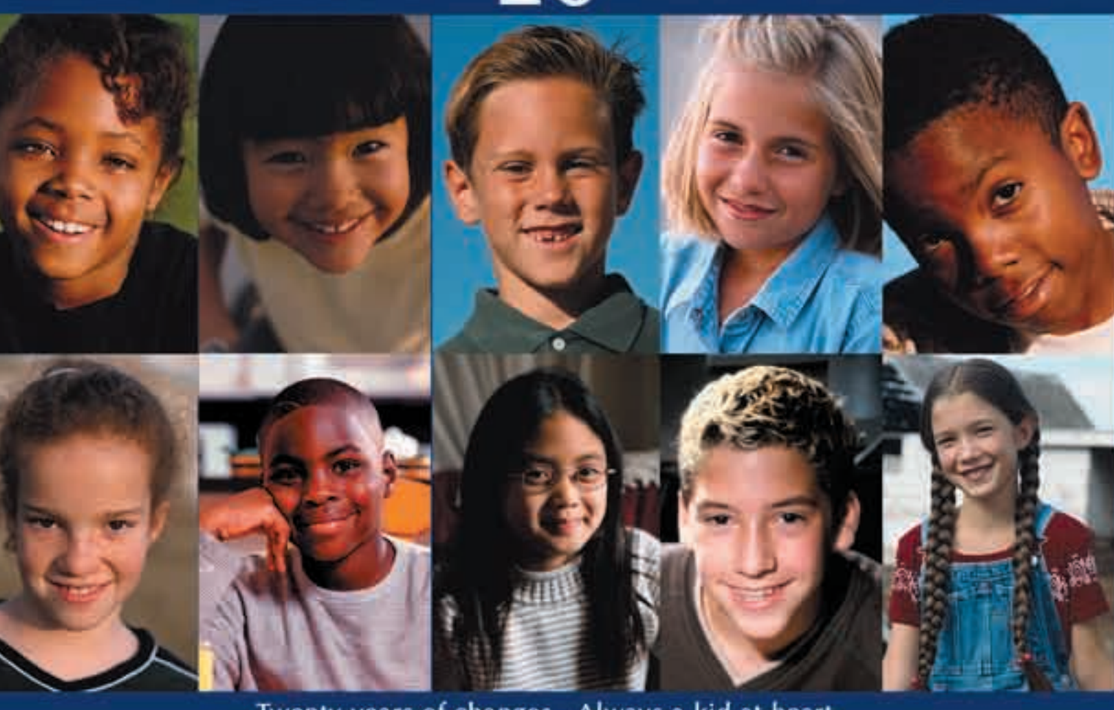
Twenty years of changes. Always a kid at heart.